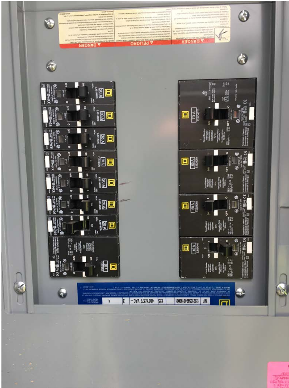
Photo 5: Inside of Electrical Panel Box (See Photo 6 for Circuit Assignments)