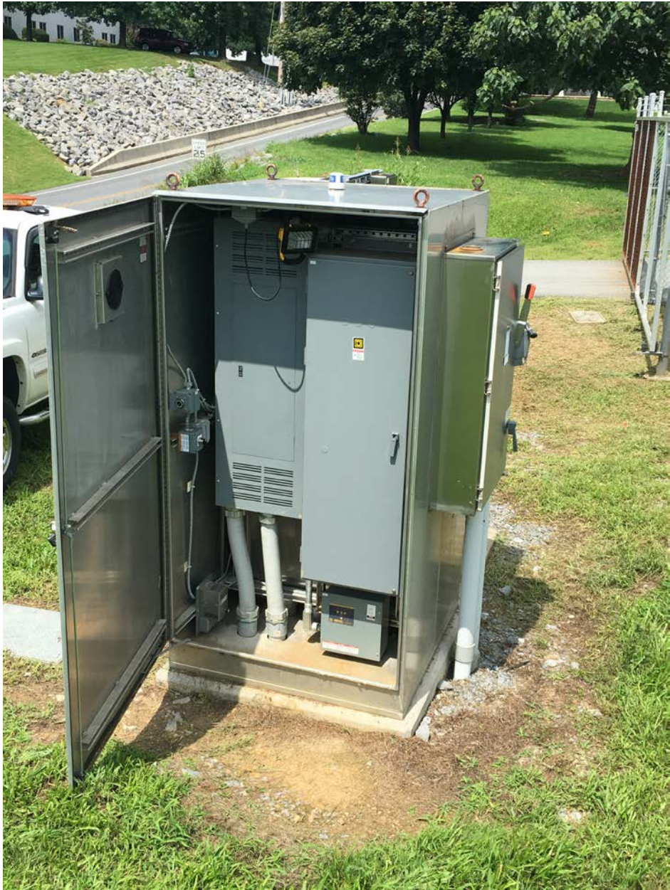
Photo 1 : Main Electrical Panel For Lighting (note Photo Sensor on top of Cabinet)